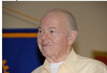
David Sirota